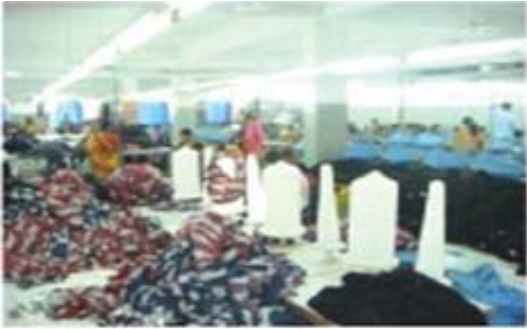
LIGHT CHECK & TRIMMING MENDING