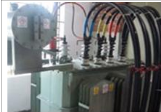
OWN POWER SUBSTAION