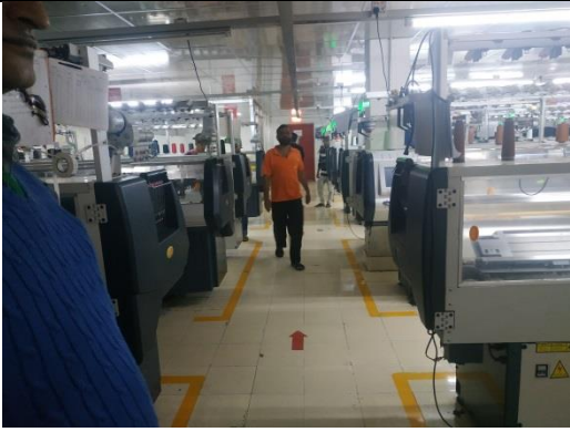
100 % FULLY COMPUTERIZED SWEATERS JACQUARD MACHINE